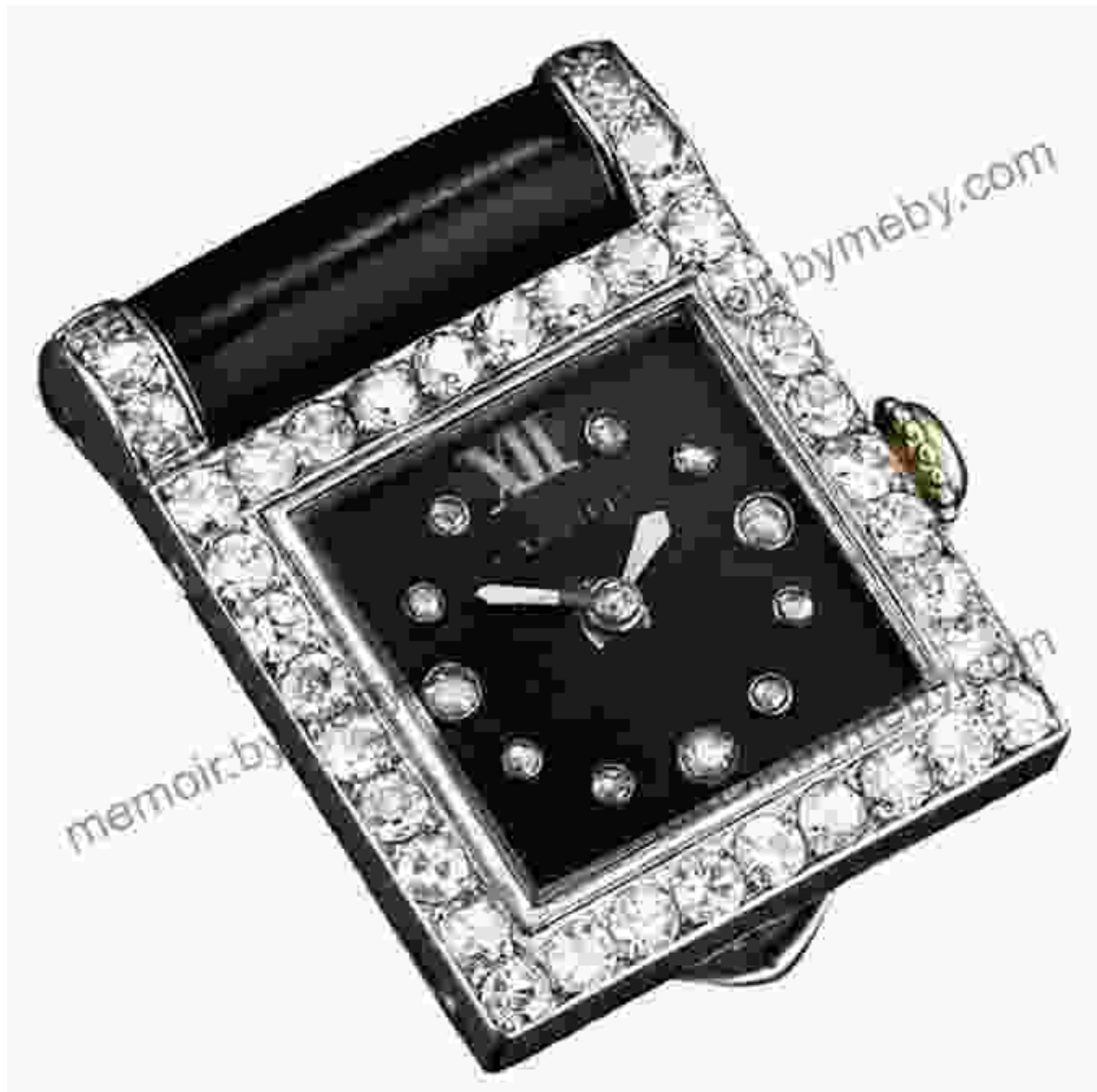
The pocket watch: A timeless treasure steeped in history.

The pocket watch, a precursor to the wristwatch, has a long and storied history dating back to the 16th century. These elegant timepieces were carried in a pocket or pouch and were often adorned with intricate engravings and decorative details. Pocket watches reached the height of their popularity in the 18th and 19th centuries and were considered indispensable accessories for both gentlemen and ladies.