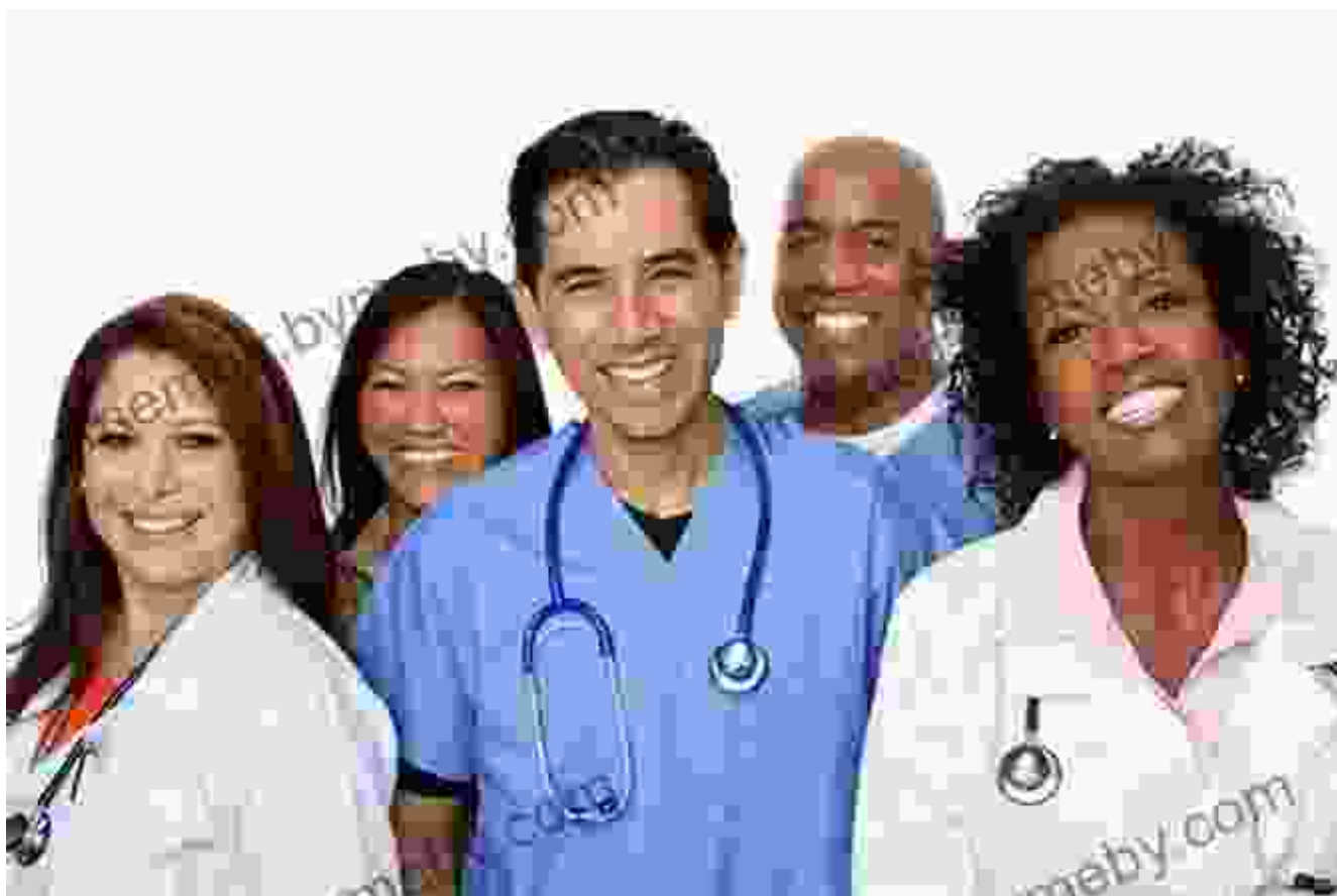
Caption: Community engagement is essential for sustainable health outcomes.

experiences and insights, we can collectively contribute to a knowledge base that will continue to advance the field of global health.