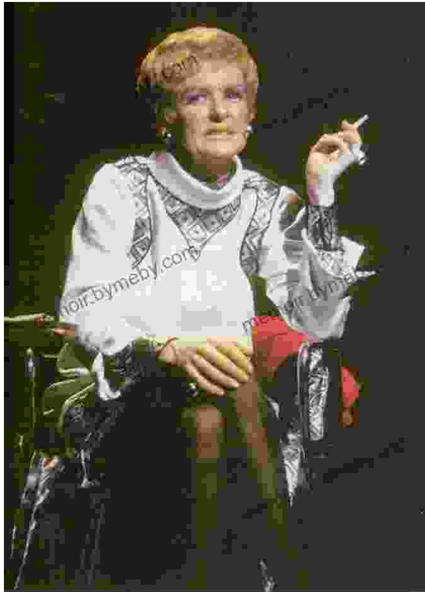
TOP: When Elaine Stritch appeared in "Barely Sane" in 1991, she was 81. She is now 91. She is still smoking and still with "The Ladies Who Lunch" party five years after the premiere of "Company".