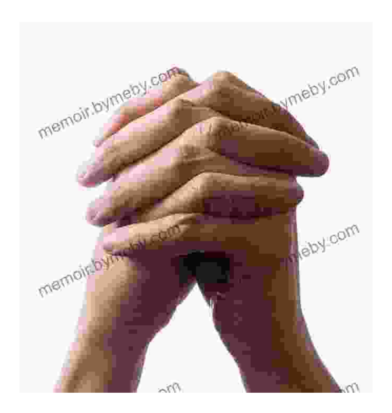
Chapter 1: Prayers for Job Security and Retention

tips, and inspiring stories that will help you unlock the power of divine intervention in your work life.